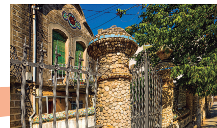
Set of houses on Jacint Verdaguer street and entrance to Can Bertrand.