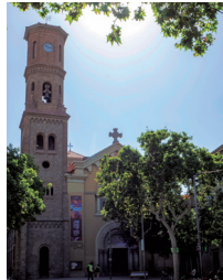
Sant Llorenç's Cathedral, in Plaça de la Vila.

Can Samaranch chimney, in Carnisser's Passage, in Falguera's neighborhood.