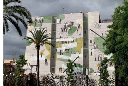
Mural dedicated to the neighborhood's movement in Plaça de la Salut.

The points of interest in Sant Feliu are numerous, highlighting Palau Falguera, the Cathedral dedicated to Sant Llorenç, Bertrand Street block of modernist residential houses or the Ermita de la Salut Chapel, among others.