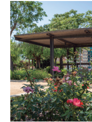
Roserar's Park sight and 0,50 pessetes Roses de Llobregat bill.

Sant Feliu has a strong link with roses. They are the symbol of the city and can be found in its different parks. The Roserar de Dot i de Camprubí is a rose theme park of 17,000 m 2 that houses 20,000 rose bushes and more than 400 rose varieties. Located in Les Grases neighbourhood, it adopted its name in homage to the main rose-breeding families from Sant Feliu de Llobregat.